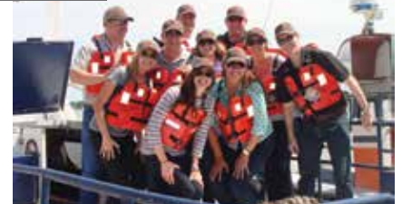
Law clerks from Kean Miller.

Turn Services also hosted Kean Miller law clerks and attorneys on an educational tour of the river, including fleeting and dry cargo midstream operations at Chalmette and Meraux. The group boarded the M/V Pyro at Chalmette Slip and traveled down to Turn Services' Meraux fleet.