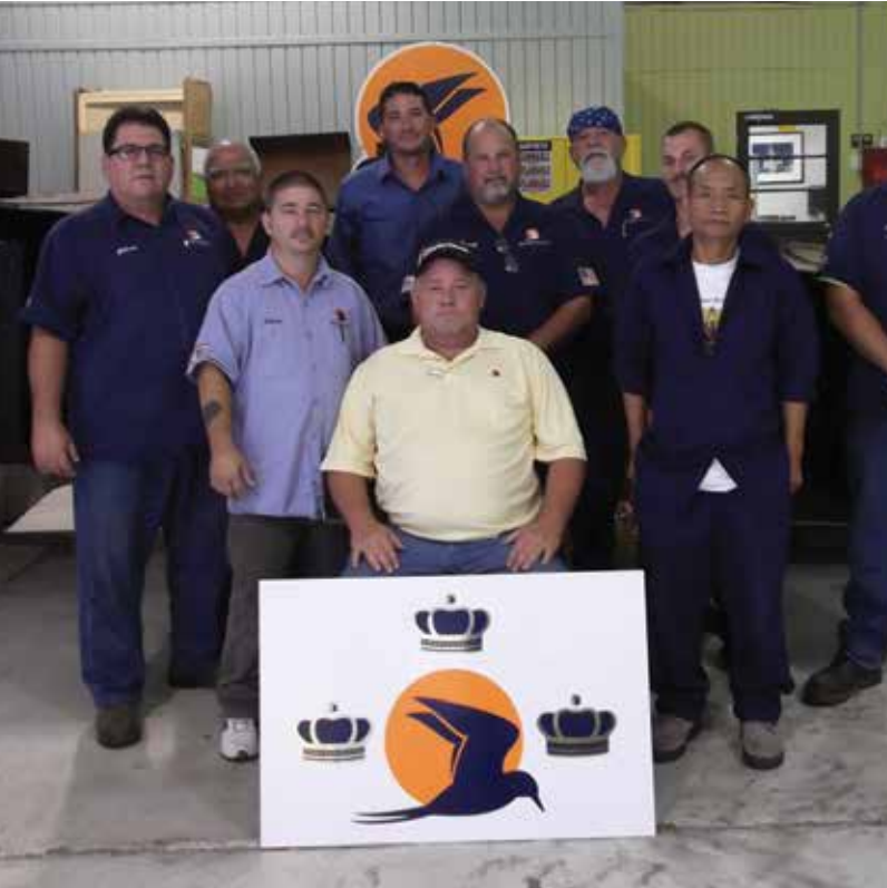
Operations center team members receive 1 year Triple Crown Award.