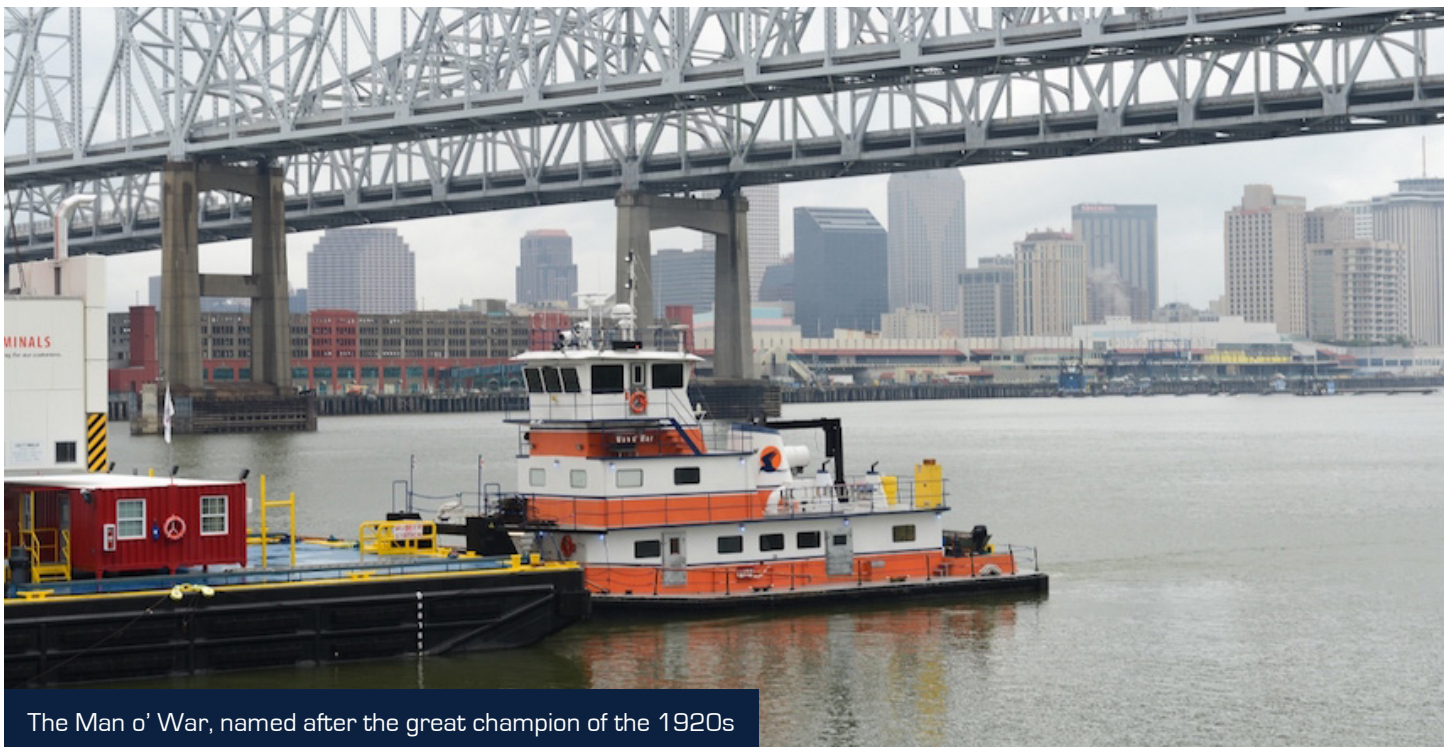
The Man o’ War, named after the great champion of the 1920s